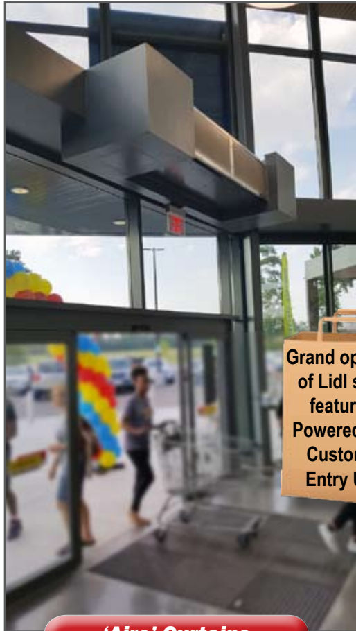
Grand opening of Lidl store featuring Powered Aire Customer Entry Unit

'Aire' Curtains integrate with custom mounting systems