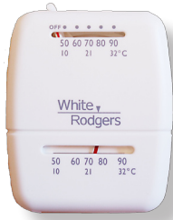
Low Voltage 24V AC Thermostat

The thermostat turns the electric or gas heat in the unit on and off while the fans are running based on the room temperature. Can be 24 volts or line voltage.