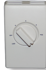
Line Voltage Thermostat

The thermostat turns the electric or gas heat in the unit on and off while the fans are running based on the room temperature. Can be 24 volts or line voltage.