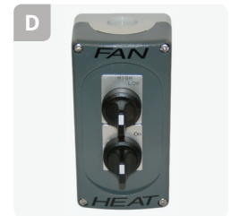
5"H x 2.5"D x 2.78"W