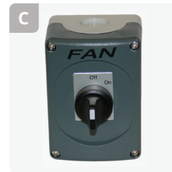
3.5"H x 2.5"D x 2.78"W