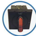
Optional HAND / OFF / AUTO switch would be located here