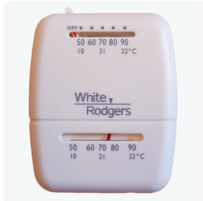
Low Voltage 24V AC Thermostat

The thermostat turns the electric or gas heat in the unit on and off while the fans are running based on the room temperature. Can be 24 volts or line voltage.