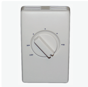
Line Voltage Thermostat