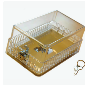
Locking Cover Limits access to the thermostat.