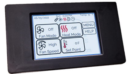
Control fan speed, run time, temperature & more with the SmartTouch (unit mount shown)

Not just a summer solution: And while we hate to bring up winter while talking about hot, humid summers, Air Curtains can be just as effective during the colder months when you're trying to keep the hot air in and cold air out. Air Curtains equipped with heat can block winter winds and keep your heating costs in check.