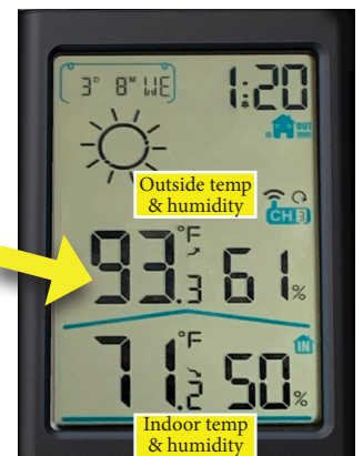
Measured 8/3/2022 in Hermitage, PA at Cianci's Italian Restaurant

The temperatures shown here were recorded on a hot/humid summer day in Hermitage, PA. The air curtain effectively maintained a comfortable indoor temperature by blocking the outside heat, regardless of how long the door remained open.