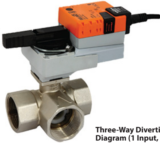
Three-Way Diverting Valve Piping Diagram (1 Input, 2 Outputs)