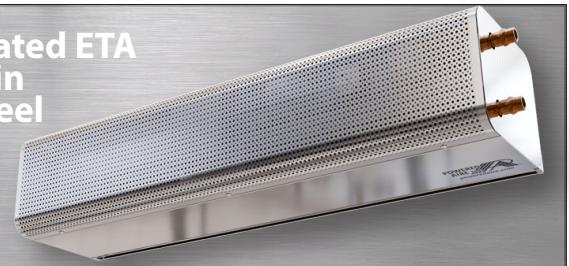
A steam-heated ETA Air Curtain in Stainless Steel

Standard on Powered Aire Air Curtains is a brushed, 304 grade Stainless Steel that is known for its durability and natural resistance to corrosion. It's also easily cleaned and sanitized. The #3 finish provides a desired balance of "polish to matte" so that the Air Curtain reflects its surroundings in a subtle manner.