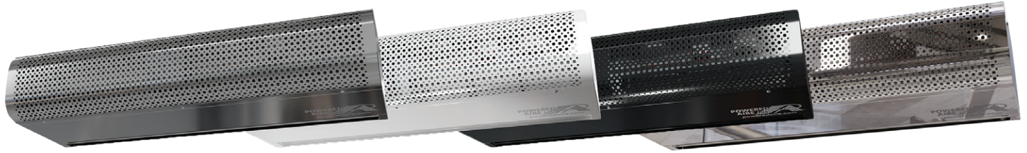
Brushed Stainless Steel