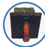
Optional HAND / OFF / AUTO switch would be located here